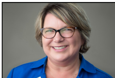
Bobbye Delaney Middle School Winner

Mission Statement: To provide quality School-based Administrative Leadership for Louisiana schools through Professional Development, Legislation and Member Services.