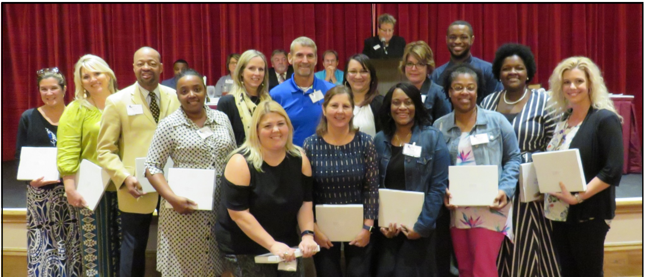
New LAP members were recognized and received their LAP plaques at the Awards Luncheon Monday, September 11 during the 66th Annual Conference.