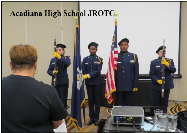
Acadiana High School JROTC