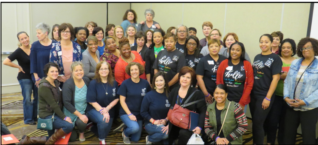
Calcasieu Parish!! The parish with the most attendees--57!! Thanks for always attending!!